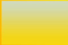
Lemon Yellow Gradient Texture