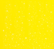
Transparent water drops