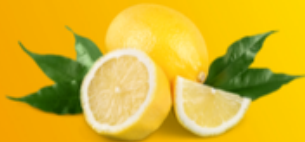
acid and lemon