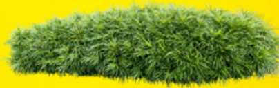
yellow aralia shrub