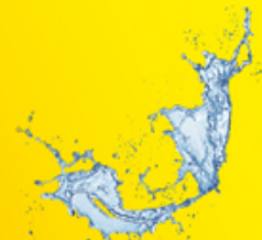
water splash cutout